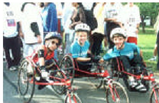
A 1998 photo of three Rochester Rookies