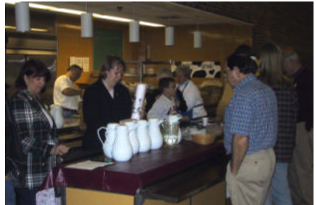
The 2001 Pancake Supper was a great success