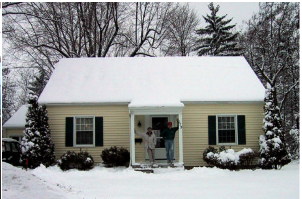
A nice home and some nice guys – Lou and Pete