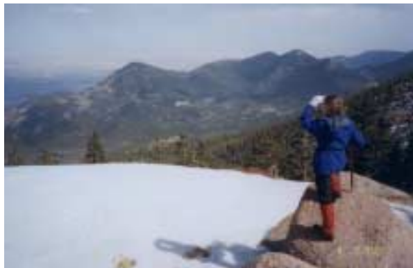
A view from Pike's Peak

"One day some of the other teachers and I decided to go on a trip to 14,000-foot Pikes Peak. We hired a prairie wagon. Near the top we had to leave the wagon and go the rest of the way on mules. I was very tired. But when I