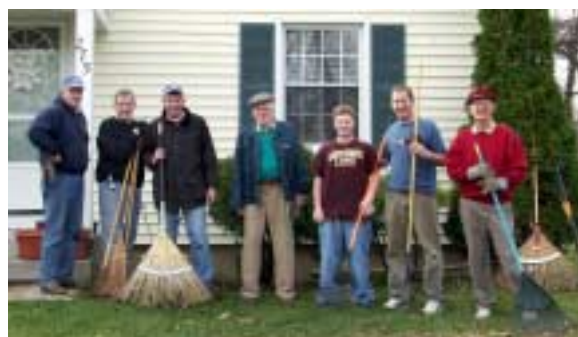
One of our many community service projects – the fall clean-up at Ronald McDonald House is coming up in late November.