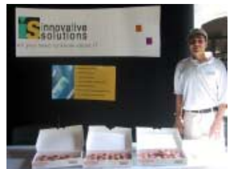
Innovative Solutions – a three-time Gold sponsor also provided Krispy Kreme doughnuts last year.