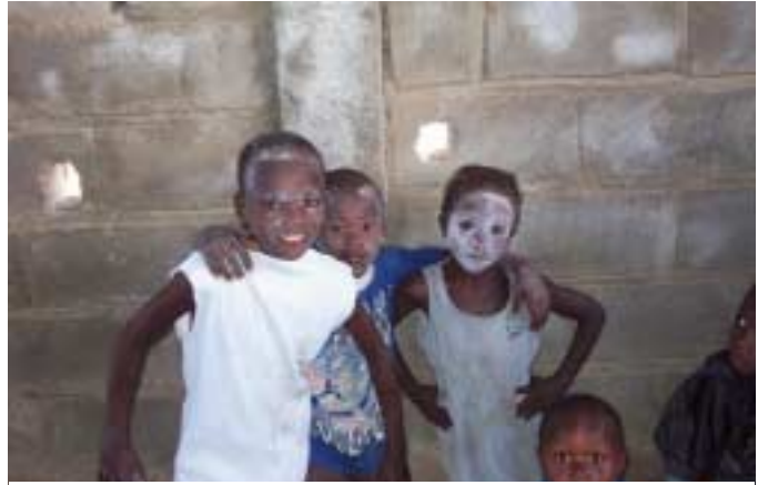
Haitian Children with chalked faces to look “white”