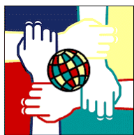
Show Rotary Cares Rotary International