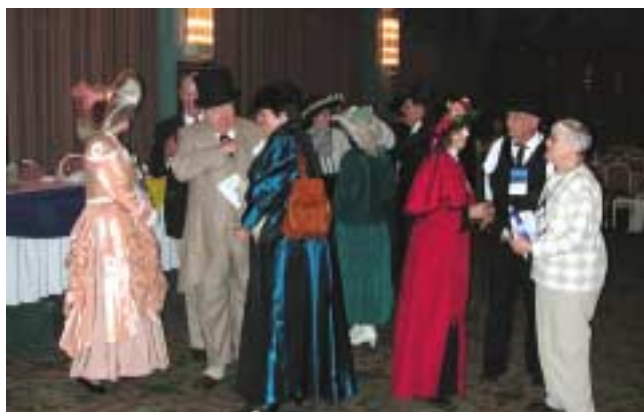
Conference goes in period clothing